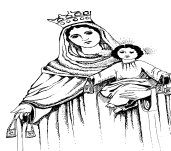
Our Lady of Mount Carmel